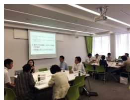
Fig. 4 the Exchange event in Tomioka Town 5)

Issues in Tomioka town • There is no medical institution • The traffic support to the SAKURA mall is not convenient. • The number of returnees does not increase.