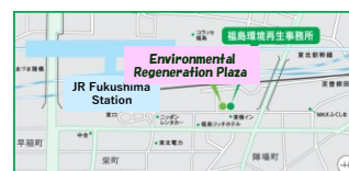
Fig. 5 The Environmental Regeneration Plaza