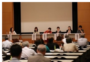
Fig. 3 Symposium "Forum for Women-Low-Dose Radiation Exposure and Health Effects", August 30, 2014

One of the major missions of the Fukushima Support Project is communication activities. Immediately after the accident, as part of our communication activities, we held a "Safety and Security Forum" (2011) and a "Regional Dialogue Forum to Promote Decontamination" (2012) in collaboration with Fukushima Prefecture. On May 14, 2012, the "1st Regional Dialogue Forum for Promotion of Decontamination" (located at Korasse Fukushima) was held mainly by the Fukushima Support Project, in order to provide easy-to-understand information to Fukushima residents. Since then, Fukushima Support Project has already held 13 symposiums in cooperation with the Ministry of the Environment, Fukushima Prefecture (Fig. 3), and related municipalities. On March 28, 2017, to mitigate reputational damages, for the first time, we held a "Consumer's Guide - What is Fukushima Produced?" event in Tokyo, a major consumption area. However, since April 2017, when evacuation orders were cancelled for areas other than difficult-to-return areas, we believed that a smaller-scale gathering would be more effective than a symposium at Hamadori, and on July 13, 2019, we held a gathering on Hamadori held an exchange event in Tomioka Town in an attempt to convey the voices of returned residents to the town hall 5) (Fig. 4).