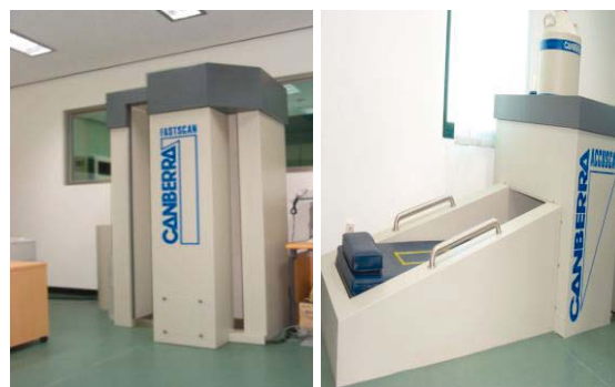
Fig. 1 Whole body counters in Korean NPPs

monitors sounded an alarm and all workers who participated in the maintenance inside the reactor building were withdrawn with a suspension of maintenance. However, a number of workers inside the reactor building were contaminated by the inhalation of 131 I. This was attributed to the fact that the radioactivity of 131 I was increased by the volatilization during the steam generator manway opening, but the volatilization velocity of iodine in the reactor coolant system was faster than expected and the withdrawal of radiation workers from the reactor building was delayed since it took time for the iodine sampling and radionuclide analysis in the air of the reactor building. 4)